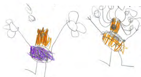
Someone forcing me to do something