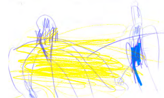
Arguing with teacher