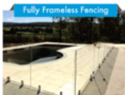
Fully Frameless Fencing