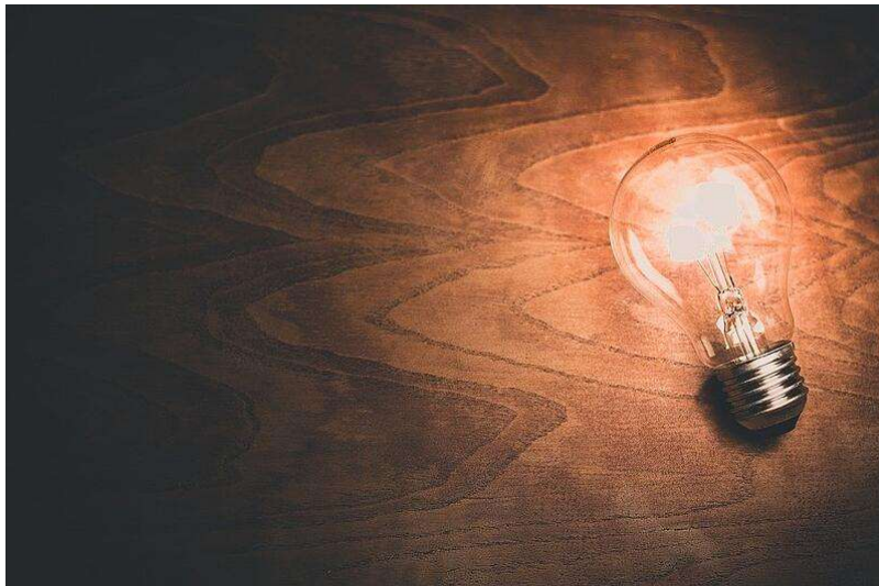
Community Jobs Handbook