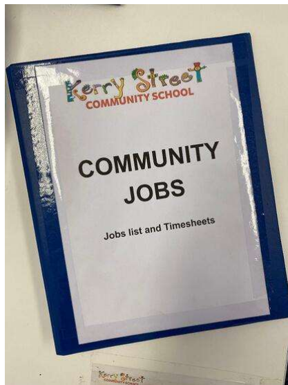
Community Jobs Timesheet