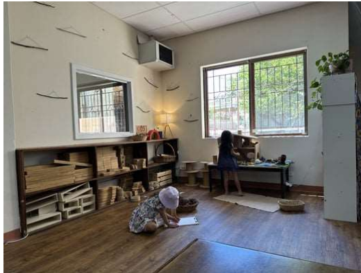
Moorditj Yonga Mia exploring light