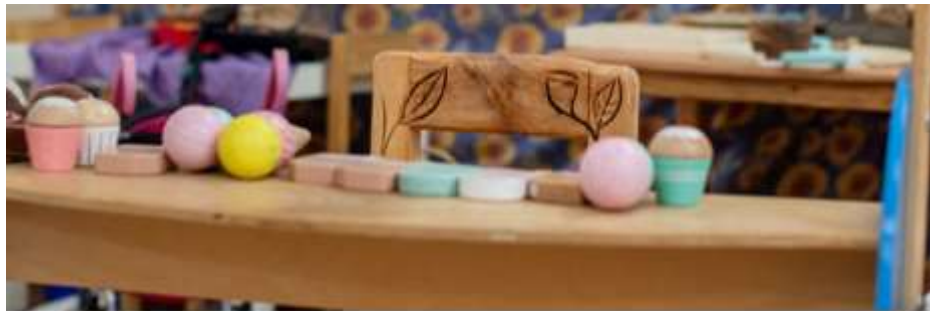
Community Jobs Handbook