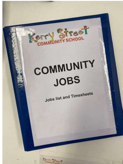
Community Jobs Timesheet